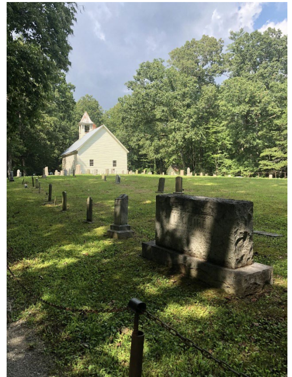
Cade's Cove Primitive Baptist Church