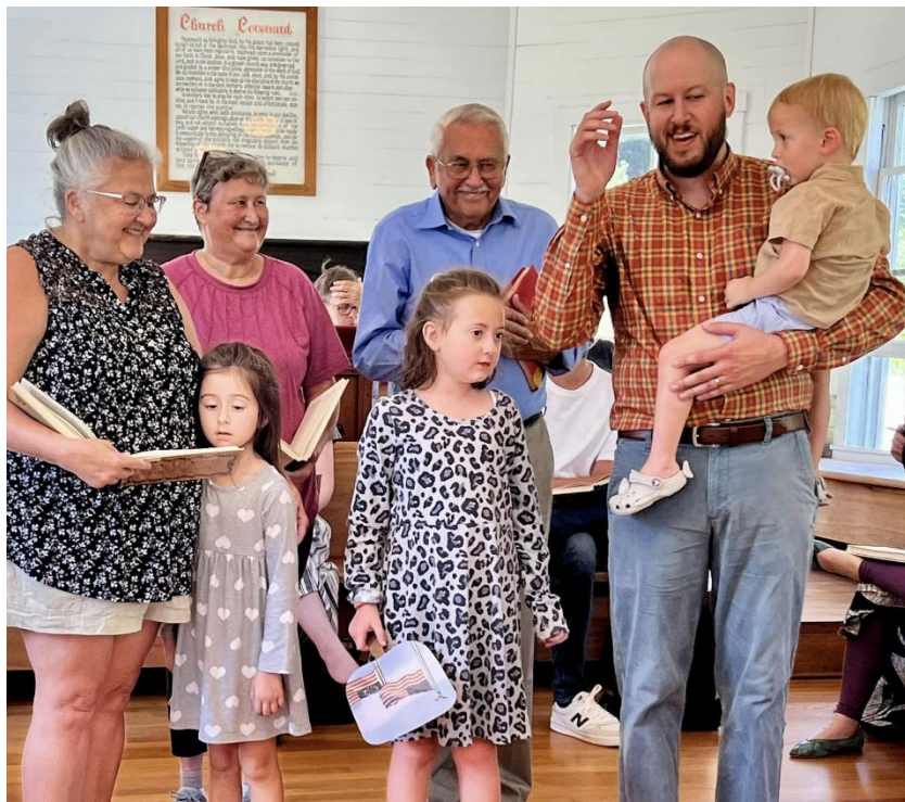
The Clabo family leads at Headrick's Chapel