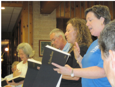
Leaders at Camp DoReMi.