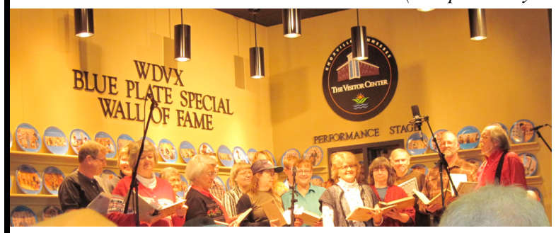
The Old Harp tradition was spread around the world thanks to our appearance on Knoxville's WDVX radio's Blue Plate Special.

As much as the people who sing Old Harp have changed over time, so have the places where we sing. From huge gatherings and popular Singing Schools in the mountains, to the current monthly and annual singings in various counties, this tradition has deep roots in East Tennessee. But our ancestors would be more than a little surprised to know this tradition is now "performed" live on the radio and TV! These days, more people get their Old Harp information from the internet or the listserve or Facebook than by mail or phone calls. And although East Tennesseans have always welcomed visitors, now we also go visit other singings and learn about other shaped-note traditions.