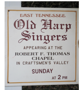
Our annual singing at Dollywood in October at the chapel some Old Harp singers helped donate and restore.

the Townsend Spring Festival and Cades Cove.