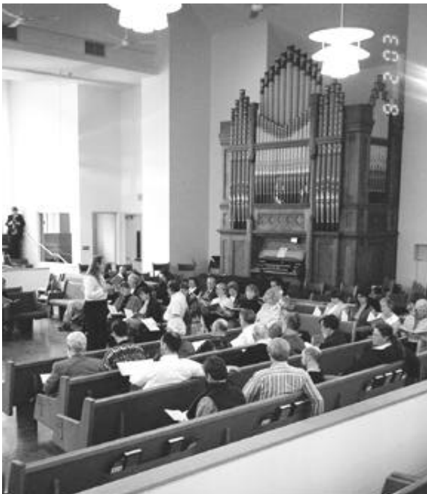
February 9, 2003 The first Old Harp Festival at Tennessee Valley Unitarian Universalist Church in Knoxville, TN.