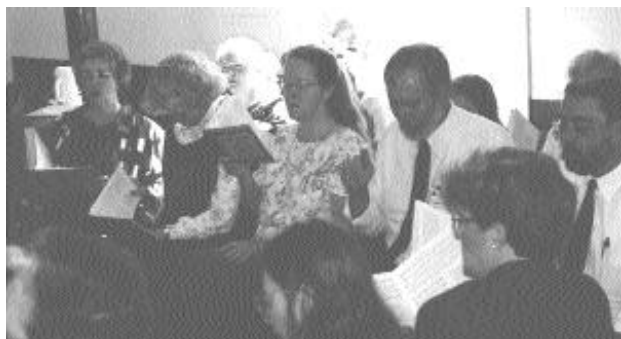
The Lead Section at last year's singing at Headrick Chapel.

Directions: From Townsend, Tennessee, take the turn onto Rt. #321 east to the Sevier County line. One hundred yards past the line is Headrick Chapel on the right.