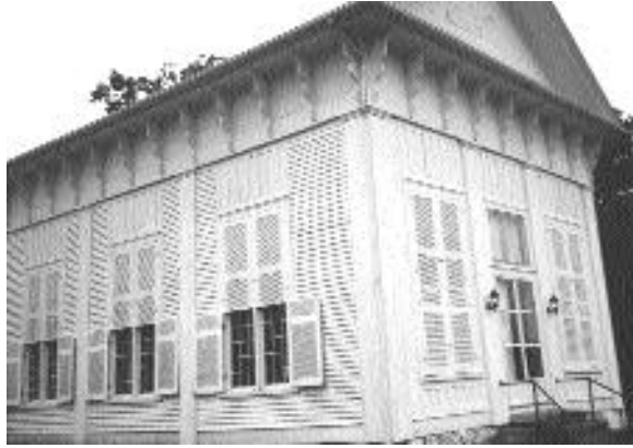
A lovely place to sing--New Bethel Cumberland Presbyterian Church in Greene County, Tennessee.